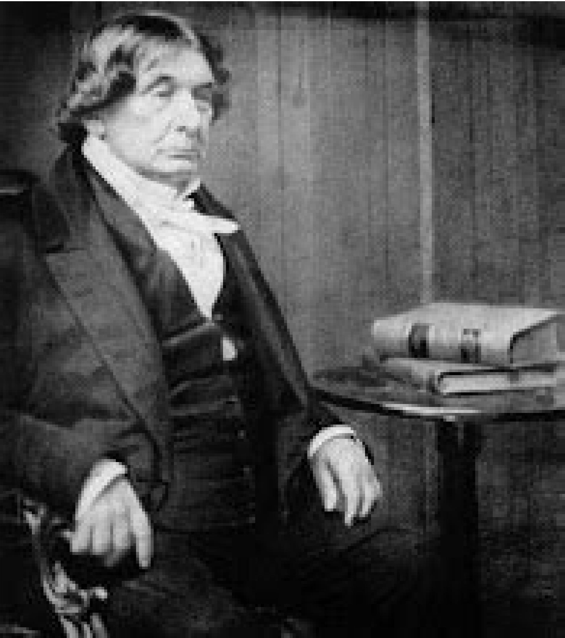
Excerpt from self-reliance commonlit answers quizlet.