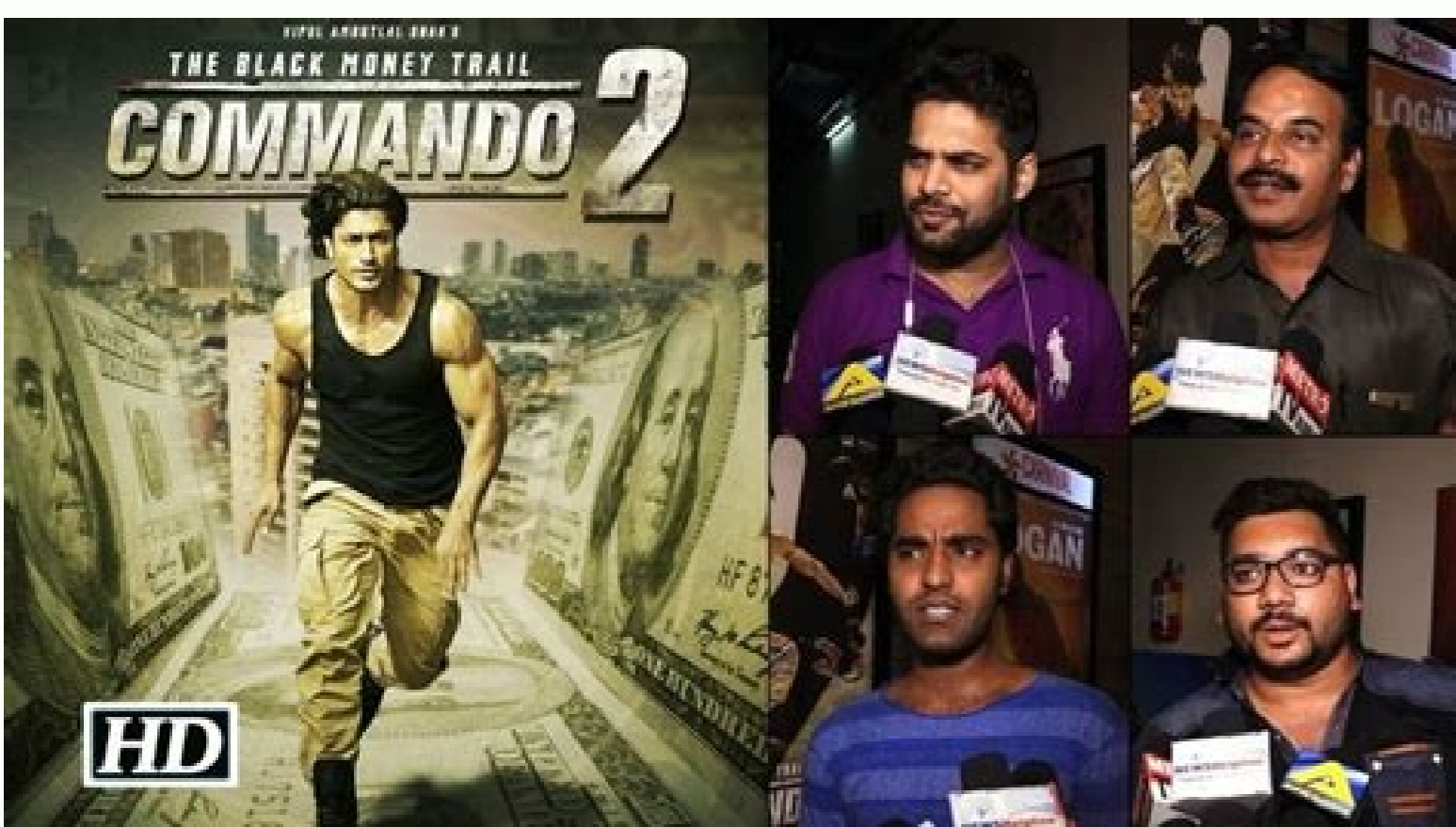
Commando 2 full movie arnold schwarzenegger. Commando 2 full game.